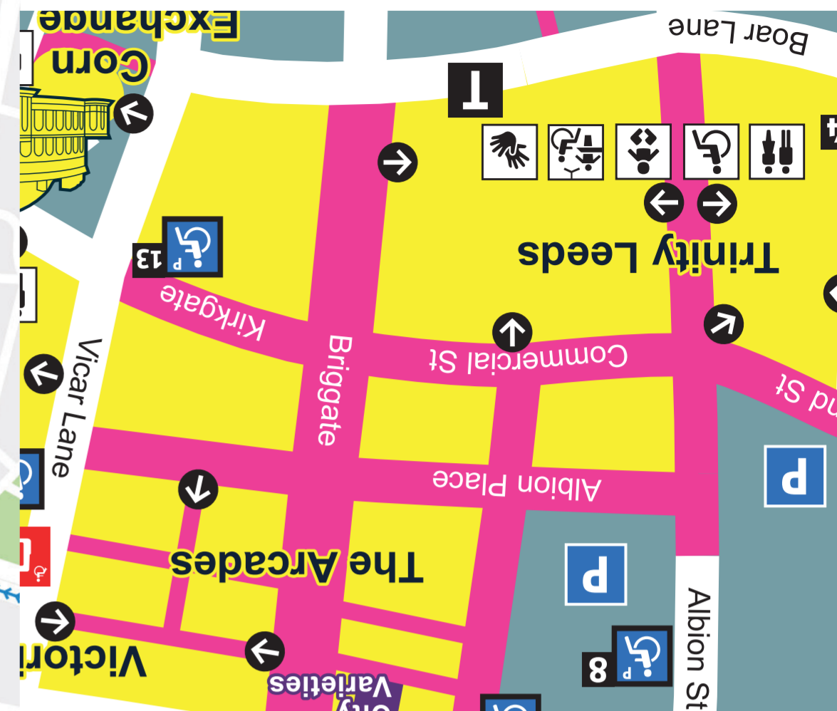
Map Access Leeds