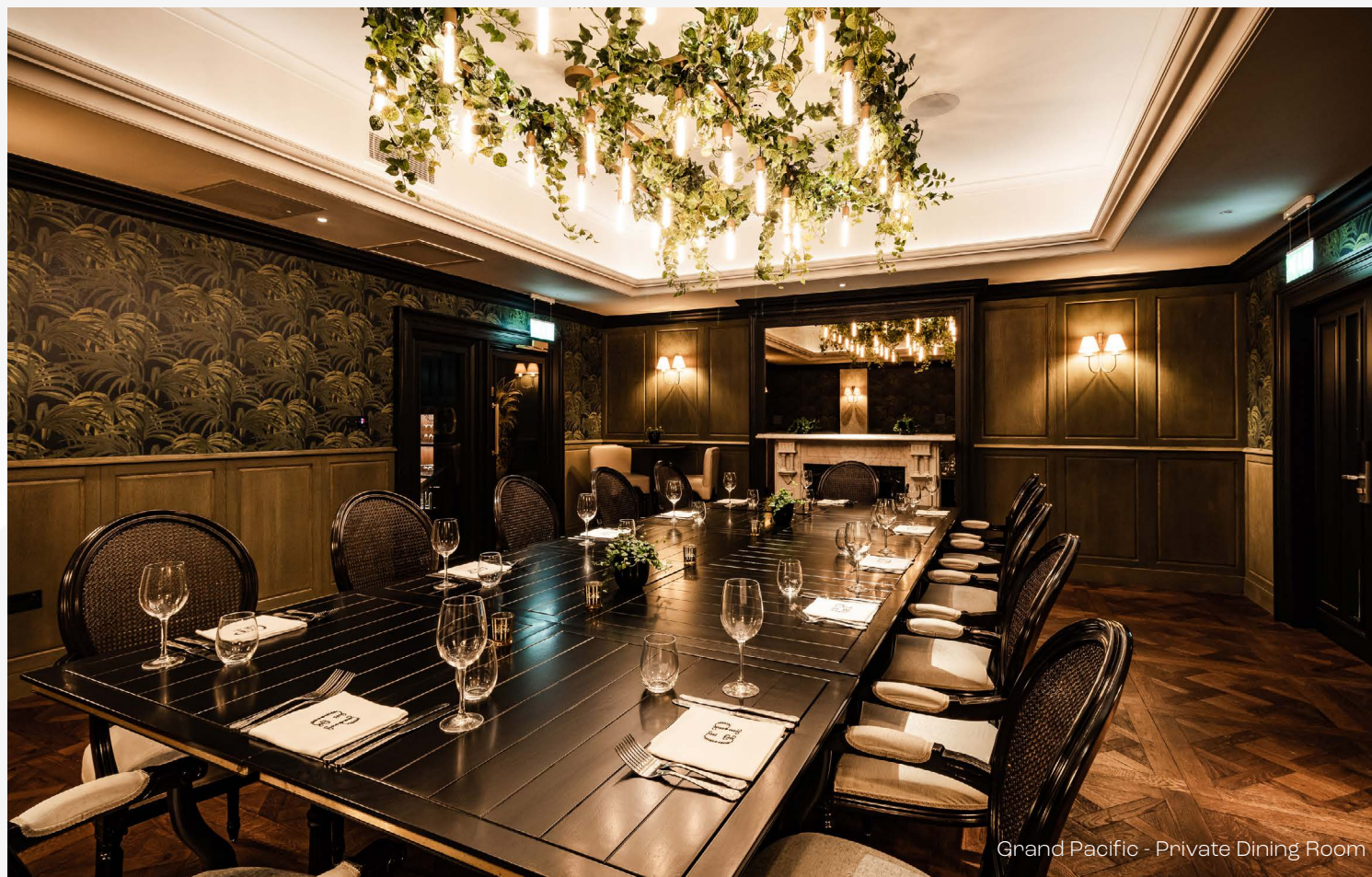
Grand Pacific - Private Dining Room