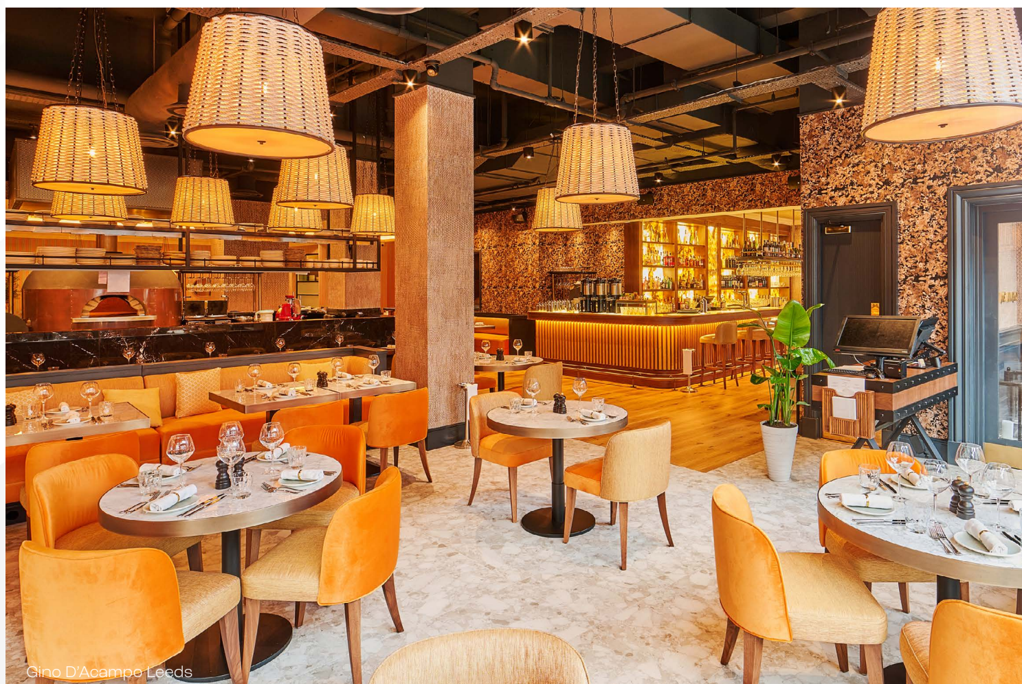
Gino D'Acampo Leeds