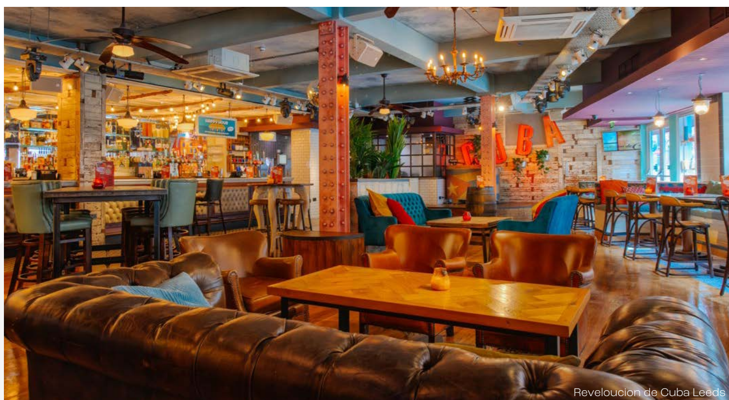
Reveloucion de Cuba Leeds