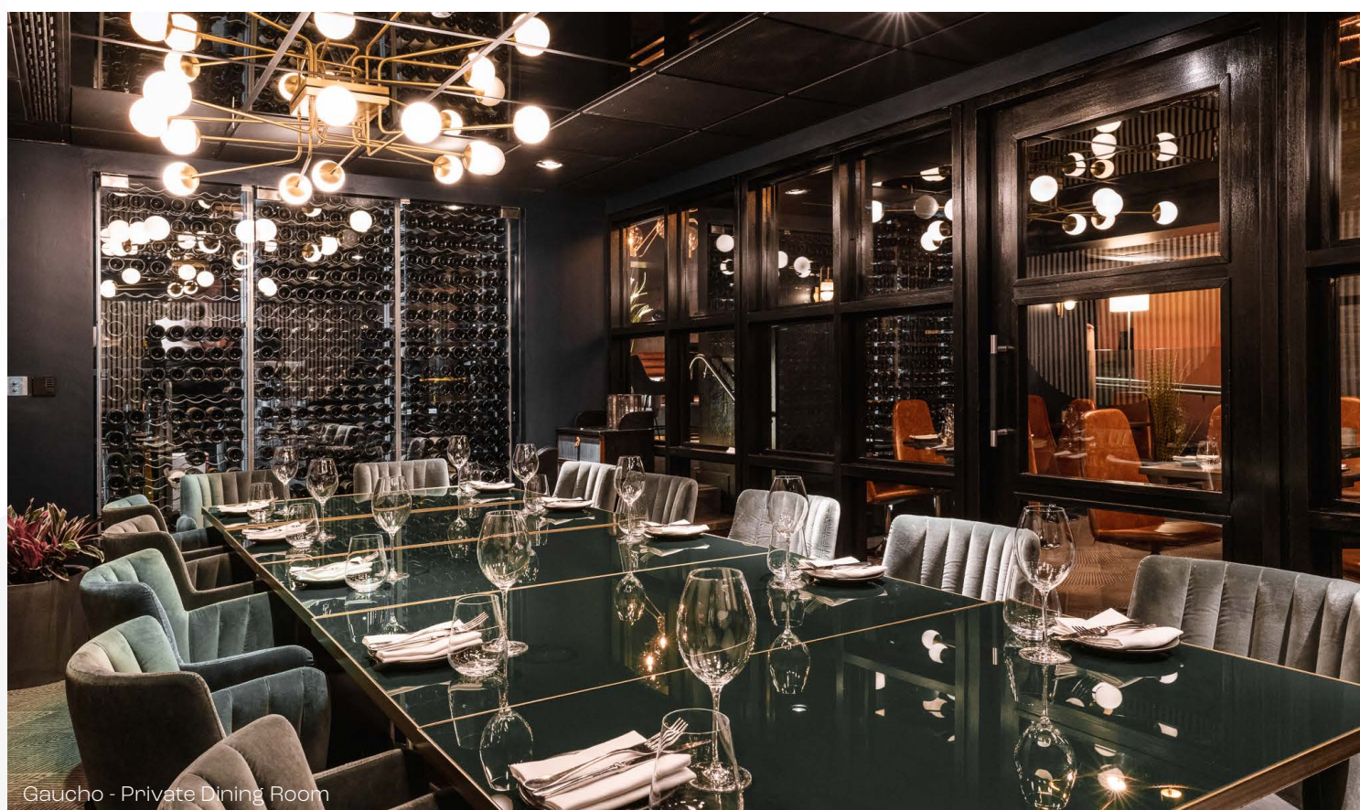
Gaucho - Private Dining Room